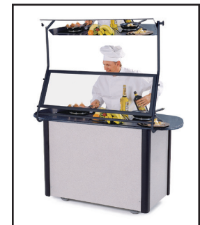
Optional food shield and demo mirror

Measurements in ( ) denote metric millimeters, unless otherwise specified. OA height with food shield is 57 1/2" (1461); OA height with demo mirror is 78 3/4" (2000).