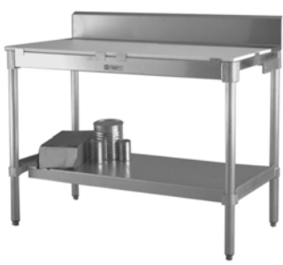
Poly Top Table with Backsplash