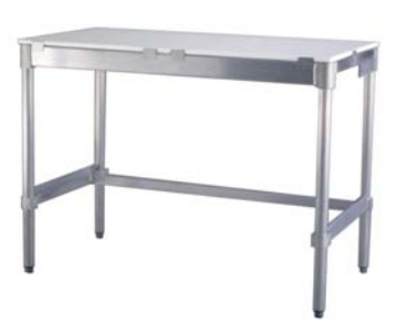
Poly Top Table

These tables carry a Lifetime Guarantee against rust and corrosion and also carry a Five-Year Guarantee against workmanship and material defects.