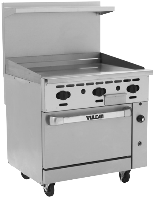
Model 36S-36GN (shown with optional casters)