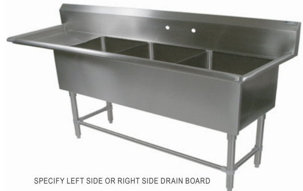
SPECIFY LEFT SIDE OR RIGHT SIDE DRAIN BOARD