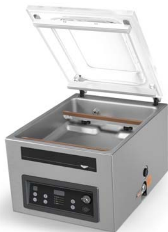
Vacuum Packing Machine with Dual 16" Sealing Bars