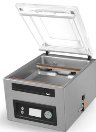
Vacuum Pack Machine with Dual 16" Sealing Bars and Advanced Control System

WARRANTY: All models shown come with Vollrath's standard warranty against defects in materials and workmanship. For full warranty details, please refer to www.Vollrath.com .