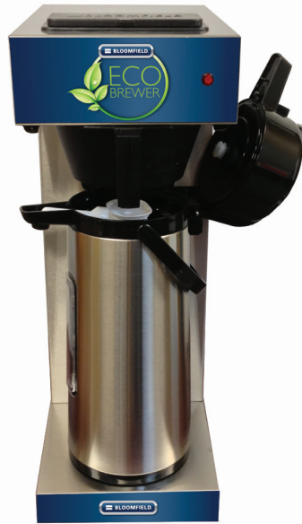
Model 4774-A (Airpot sold separately)