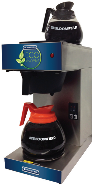
Model 4543-D2 (decanter sold separately)