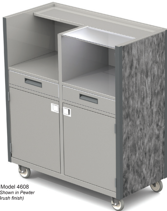
Model 4608 (Shown in Pewter Brush finish)