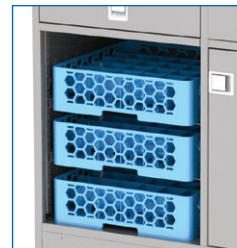
Open compartment option (door removed)