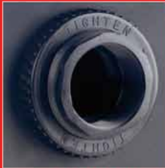
Serviceable Bulk Head Fittings available in 2" and 3".