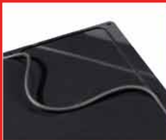
"D" Ring gaskets on covers.