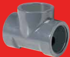
All Units include flow control, shipped inside.