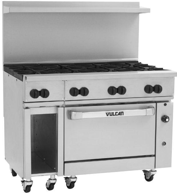
Model 48S-8BN (shown with optional casters)