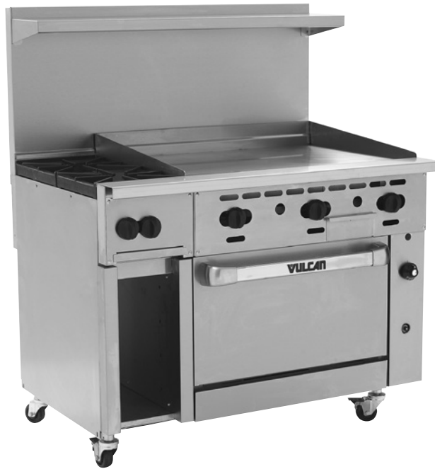
Model 48S-2B36GN (shown with optional casters)