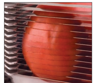
Blades are razor-sharp stainless steel for a smooth, precise cut.