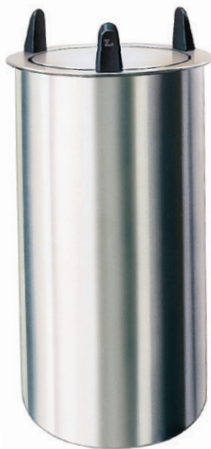
Model 5009 Shielded