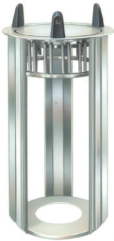
Model 4009 Open