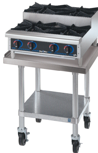
Model 604HD-SU with Optional Equipment Stand