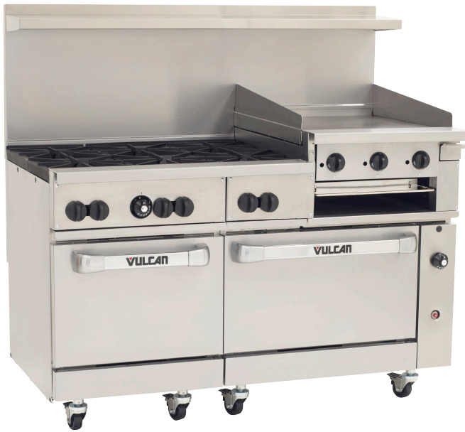
Model 60SS-6B-24GB-N (shown with optional casters)

Connect-a-Range shipped in multiple cartons