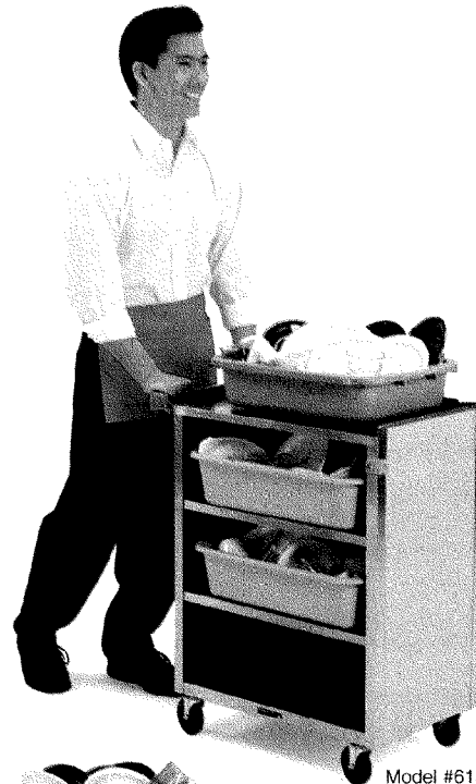
Model #615 shown in optional Gray Sand Designer Series finish.

Optional accessories include: detachable silverware and waste boxes, see page 13. Optional hinged doors, see page 10. Optional Wall-Saver perimeter bumper, see page 7.