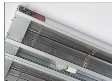
Optional showcase lighting adds visual appeal.