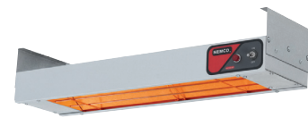
Model 6150-24, with hanging brackets