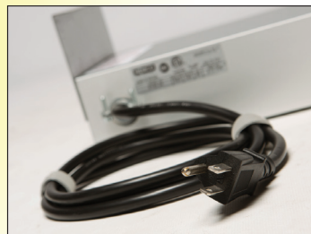
Optional cord-and-plug units simplify installation.