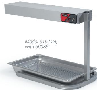
Model 6152-24, with 66089