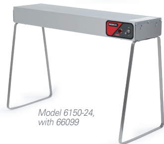
Model 6150-24, with 66099

Power option: Standard on/off toggle switch (shown) or 'infinite' temperature control dial for varying low, medium and high heat settings.