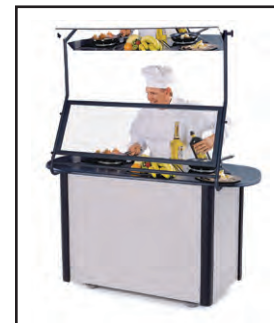
Optional food shield and demo mirror

Measurements in ( ) denote metric millimeters, unless otherwise specified. OA height with food shield is 57 1/2" (1461); OA height with demo mirror is 78 1/4" (2000).