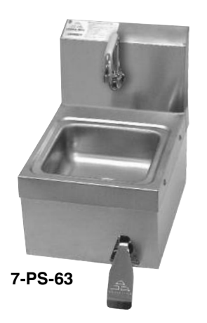
See page A-7 for more Space Saver Units