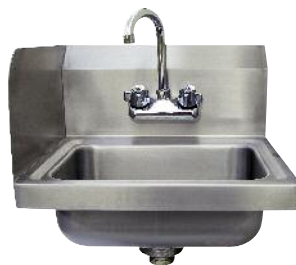
7-PS-EC-SPRorL (7-PS-EC-SPL Shown)