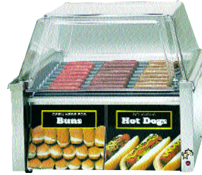
Model 30SCBD with Sneeze Guard