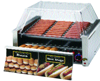
Model 50CBD with Sneeze Guard