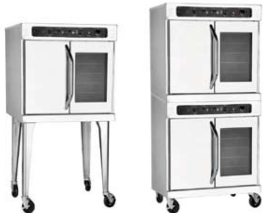
8000 Single Oven

Oven shall be constructed of stainless steel on front, sides and top. Oven doors swing open 135° for easier access for loading and unloading. Stainless steel handle adds to the rugged construction and beauty in your kitchen. If you are looking for superior quality and commitment to performance, you can rely on the Space Saver Series Convection Ovens.