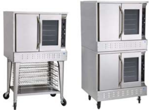
8300 Single Oven Shown with Optional Bottom Shelf and Storage Racks

Oven shall be constructed of stainless steel on front, sides and top. Oven doors swing open 135° for easier access for loading and unloading. Oven interior is porcelain coated for protection from spills. Stainless steel handle adds to the rugged construction and beauty in your kitchen. If you are looking for superior quality and commitment to performance, you can rely on the High Efficiency Convection Ovens.