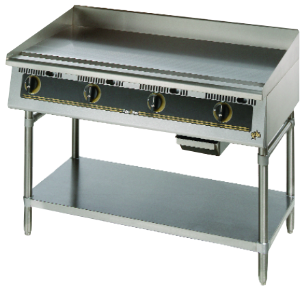
Model 848M Shown with Optional Floor Stand

Ultra-Max griddles feature 1" thick highly polished steel griddle plate with 5" tapered stainless steel splash guard and 3-1/2" wide front access grease trough with 6 quart grease drawer capacity. Models 860M and 872M house two 6 quart grease drawers. Includes a 30,000 BTU aluminized steel burner every 12" of width controlled by manual control valve with standing pilot light, 3/4" N.P.T. male gas connection with convertible pressure regulator, and 4" adjustable legs.