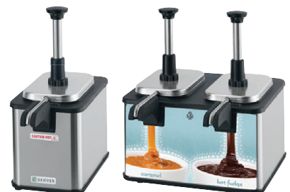
EZT-S & EZT short models

Models accommodate large and small operations, serving 1 or 2 toppings with or without the ability to pre-heat a reserve pouch; single unit also available without spout heater.