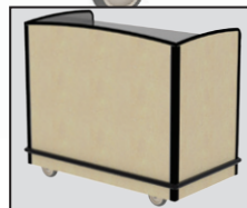
Beige Suede laminate finish