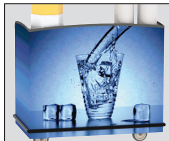
Optional vinyl wrap graphic