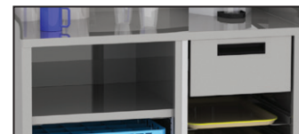
Optional pull-out shelf and drawer