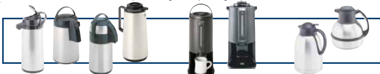
Complete line of Airpots for use with brewers with 13 3/8" clearance heights

ACCESSORIES: See the Bloomfield Brew Brew product catalog for a complete listing of brewers and accessories.