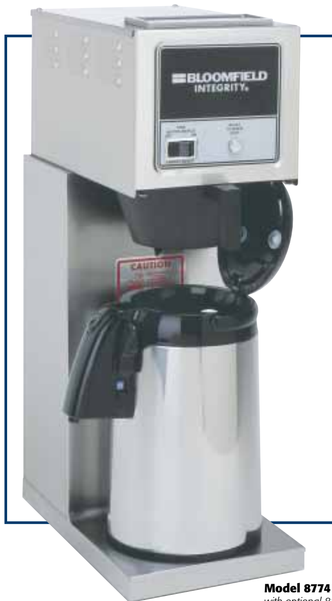
Model 8774 with optional 8881