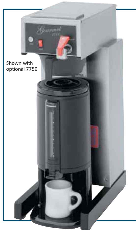
Shown with optional 7750