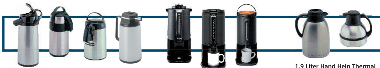
Complete line of airpots are compatible with this model using the Brew Buddy (p/n 3774)

ACCESSORIES: See the Bloomfield Brew Brew product catalog for a complete listing of brewers and accessories.