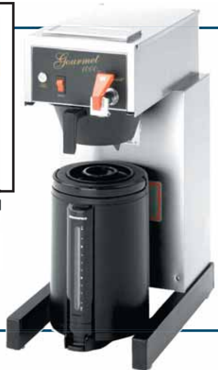
Model 8788/8782 shown with optional 7752