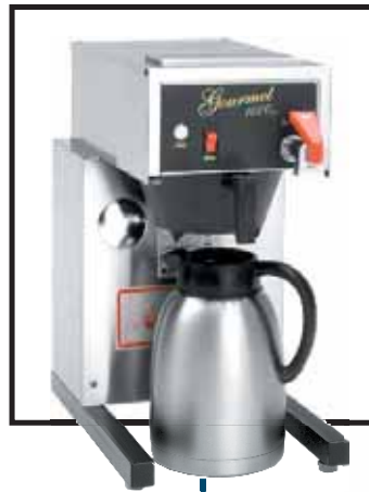
Model 8782XL shown with optional 7874

Airpot Coffee brewers offer volume brewing, proper extraction and holding capacity in a limited space. The 8782XL, at an extra low height of only 17 3/4", is sure to fit in those tight counters. These uniquely designed units eliminate flow control problems, and resist clogging in adverse water conditions. Coffee is brewed into a thermal server or airpot for easy transport to remote serving areas where the coffee will be preserved for optimal temperature and taste.