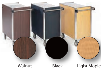
Walnut Black Light Maple