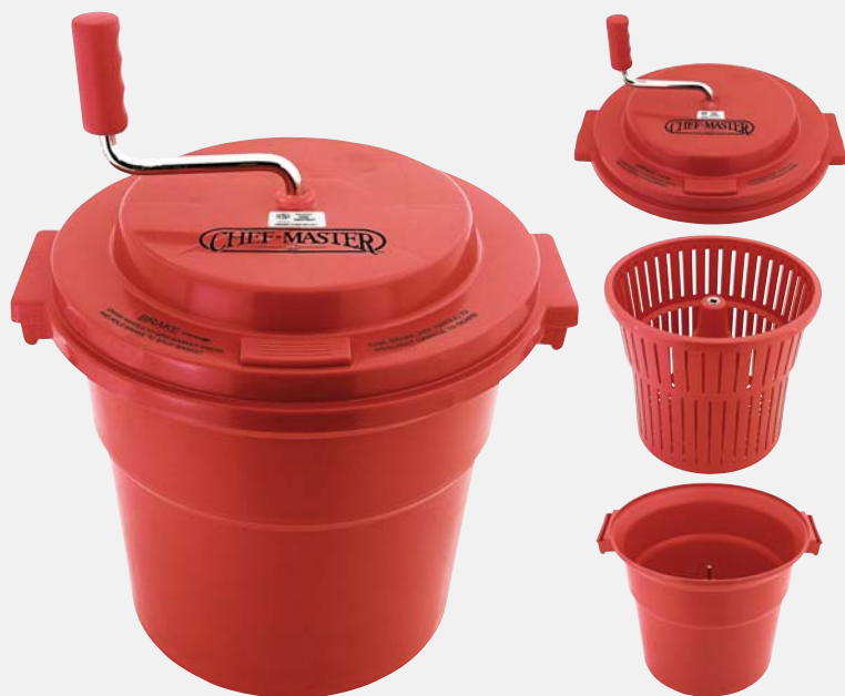
Item No: 90005