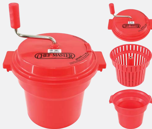
Item No: 90012