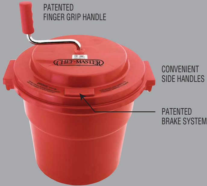
Item No: 90005