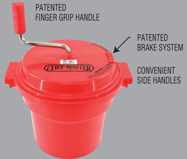
Item No: 90012