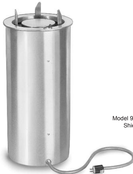
Model 92325 Shielded