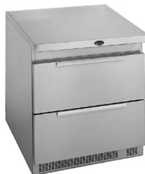
model 9404-32D-7 shown

REFRIGERATION: CFC free, R-134a (refrigerators), R-404a (freezer) back-mounted refrigeration system to be self-contained with evaporator blower coil, compressor, thermostatic control, forced-air condensing coil and capillary tube contained in removable assembly. Condensate evaporator provided. Units totally prewired and to be supplied with 8' cordset (NEMA 5-15P) for 115V operation. "Front Breathing" refrigeration system, requires no side or back clearance. Integrated rubber bumpers provide 1" rear clearance on model 9301F-7.