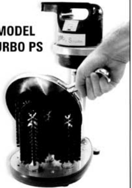
MODEL TURBO PS