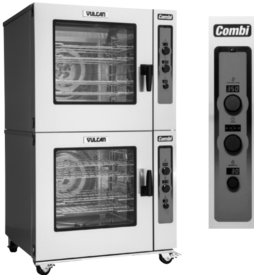
Model ABC7E (shown stacked)