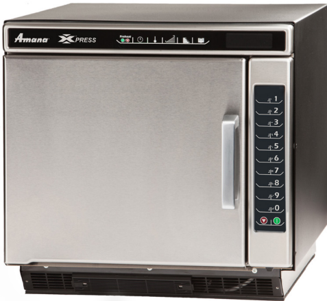
Model ACE19N shown