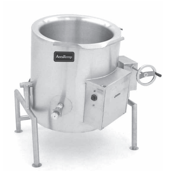
Model ALTWE-60 (shown with optional 1 1/2 draw-off valve)