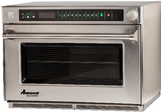
Model AMSO35 shown