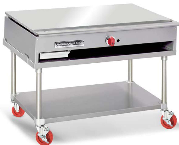
Model Shown ARTY-48