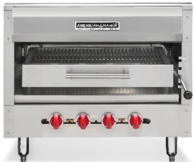
Model Shown AGBU-I

The American Range Counter Top Infrared Overfired Broiler has a reputation that lives up to its name. The AGBU-I gas-fired powerhouse has four infrared burners that direct nearly 100,000 BTU/hr. of 1850° infrared heat downward to penetrate and sear the exposed surface of the meat, fish, vegetable or casserole products. Since the cooking is accomplished using only infrared heat, the food experiences minimal shrinkage and retains juices, tenderness and flavor.