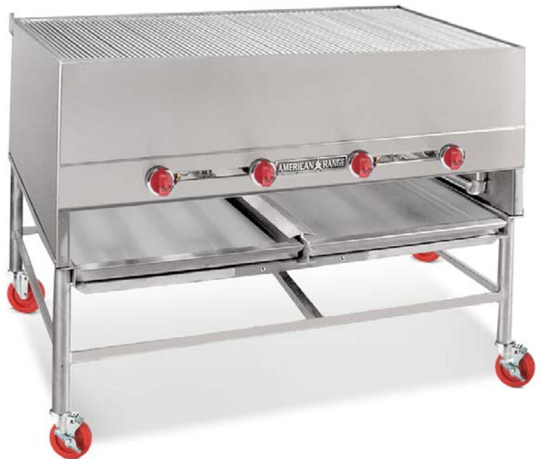
Model AHS-4836 Shown with optional stand & casters.

The American Range AHS Horizontal Chicken Broiler brings the flavor and excitement of backyard chicken broiling to the commercial kitchen. Design engineered with an open bottom grate for optimal fuel combustion, and round rod non-stick cooking grates, the high BTU output of the AHS assures even heat distribution for fully cooked chickens.