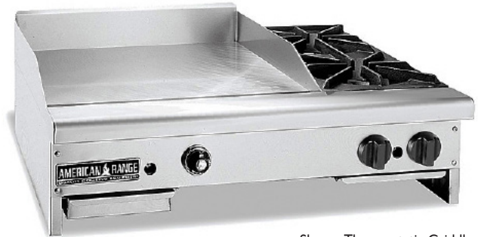
Shown: Thermostatic Griddle Model AR36-24TG2OB