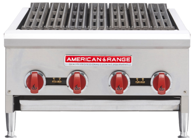
Model Shown ARRB-24