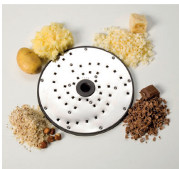
14, 17, 19