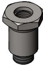
000821-40 Spring Body (Qty 1)