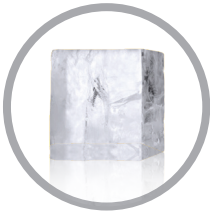
Perfectly square, slow-melting individual big cubes