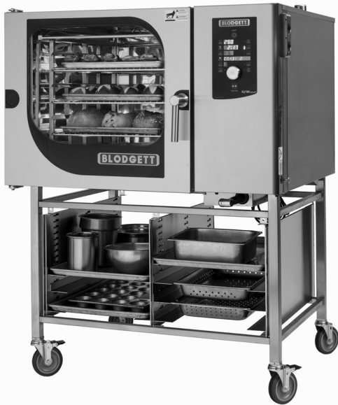
Shown on optional stand with casters