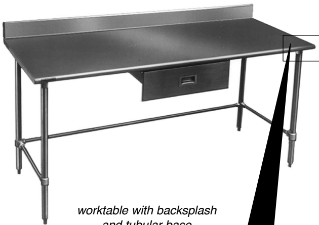
worktable with backsplash and tubular base —shown with optional drawer

Blendport worktables, Budget series, model _____. Top to be constructed of heavy gauge type 430 stainless steel with 1½" roll on front, 4½" backsplash, and sides turned down 90°. Open front with 1¼" O.D., stainless steel tubular crossbracing on sides and rear. Top reinforced with welded hat channels and sound deadened. Constructed with uni-lok® patented gusset system with the gussets recessed into the hat channels to reduce lateral movement. Legs to be 1½" O.D. stainless steel tubing, with stainless steel gussets and 1" stainless steel adjustable bullet feet.