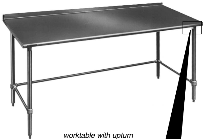
worktable with upturn and tubular base

Blendport worktables, Budget series model _____. Top constructed of heavy gauge type 430 stainless steel with 1½" roll on front, 1½" rear upturn, and sides turned down 90°. Open front with 1¼" O.D. galvanized tubular crossbracing on sides and rear. Top reinforced with hat channels and sound deadened. Constructed with uni-lok® patented gusset system with the gussets recessed into the hat channels to reduce lateral movement. Legs are 1½" O.D. galvanized tubing with galvanized gussets and 1" hi-impact plastic bullet feet.