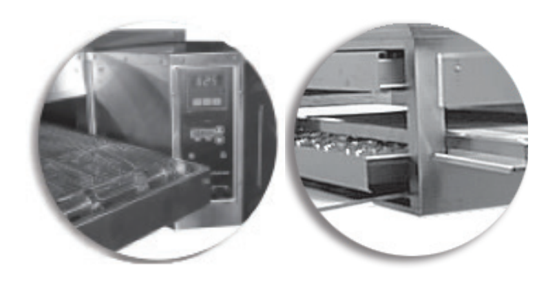
Removable panels for easy cleaning